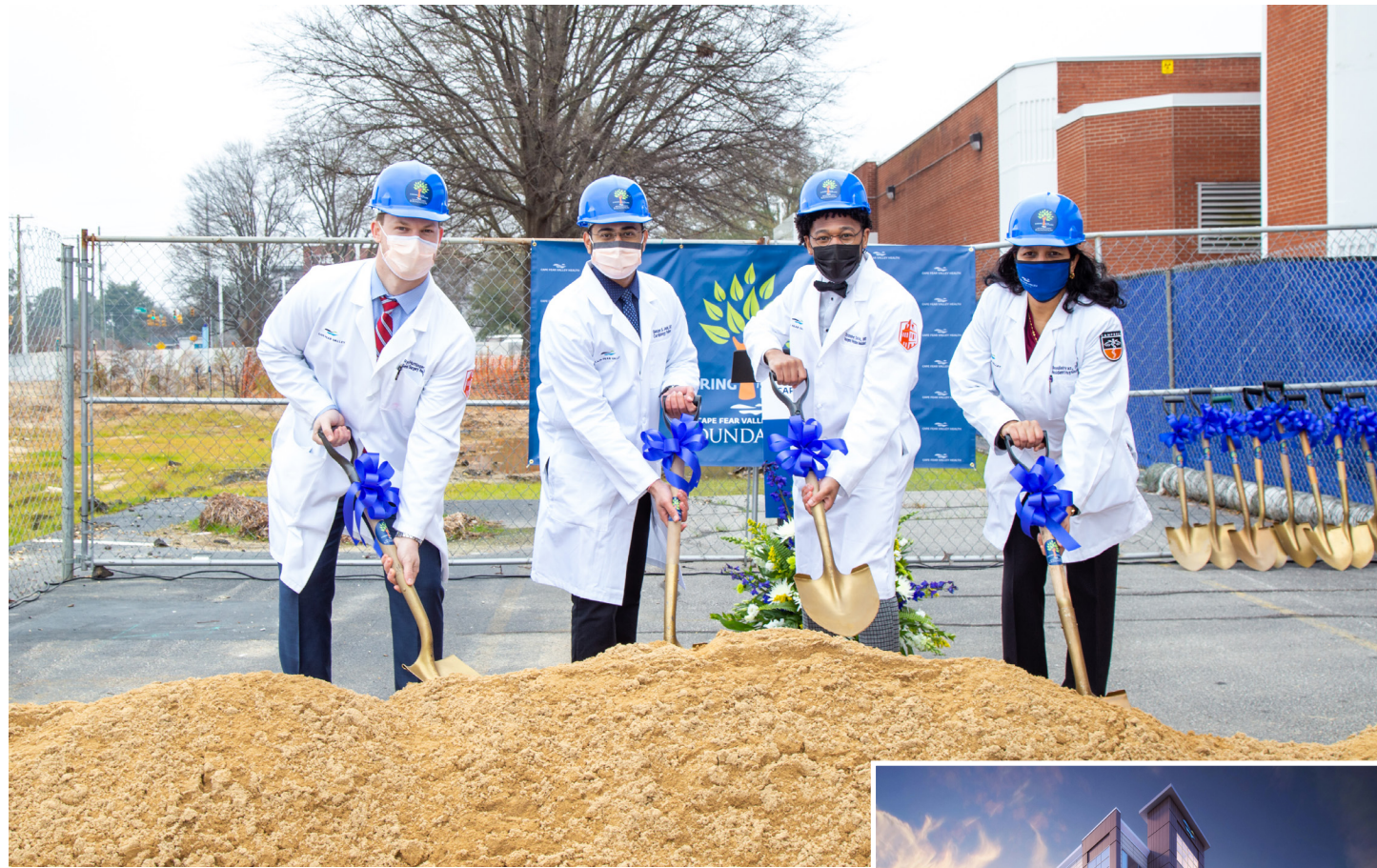
Cape Fear Valley medical residents at the groundbreaking ceremony in Jan. 2021.